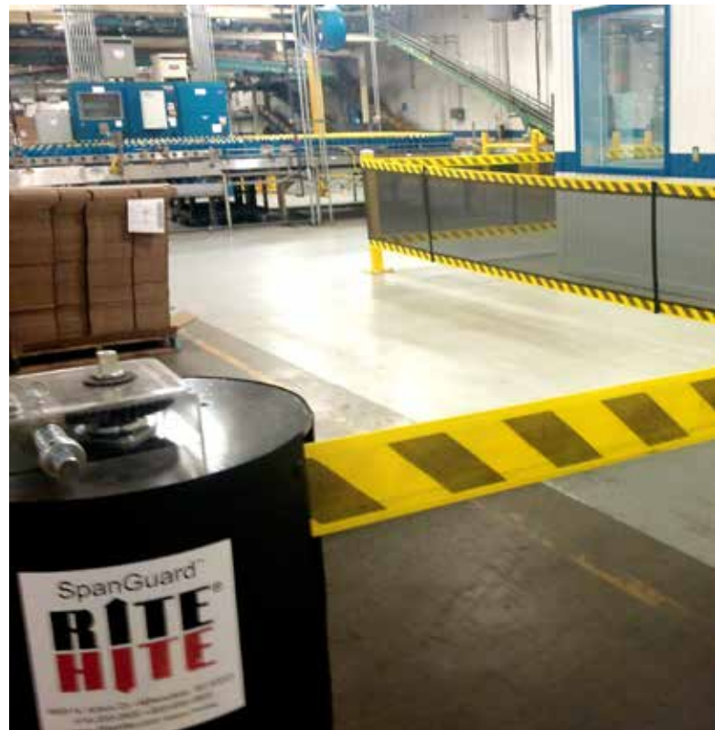
Rite-Hite SpanGuard Safety Barrier

Roughly 34,900 people are seriously injured and 85 killed every year in forklift-related incidents across the U.S., according to OSHA.