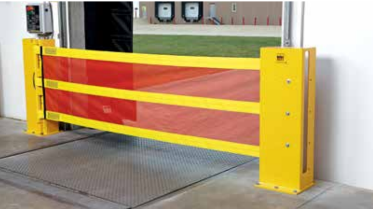
Rite-Hite Dok-Guardian Safety Barrier

Industrial facilities are inherently dangerous and use a variety of barriers to protect people, products and property. In some instances, these barriers may simply separate pedestrian traffic from other internal vehicle traffic. In other facilities, barriers may be employed to keep people away from automated processes and machinery or to protect employees against falls. Barriers may also be used to protect production equipment and/or the building itself from vehicle damage. In all cases, barriers play an important role in helping facilities operate safely and efficiently. An appropriate safety barrier should only be selected after evaluating the application criteria.